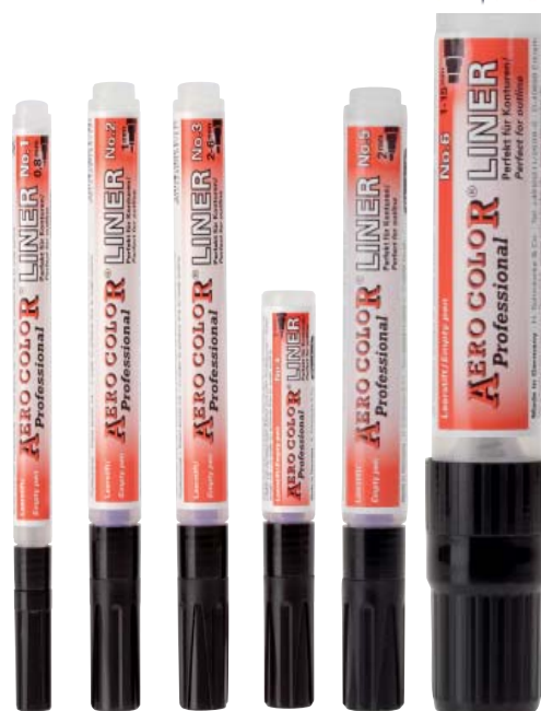
No. 1 No. 2 No. 3 No. 4 No. 5 No. 6