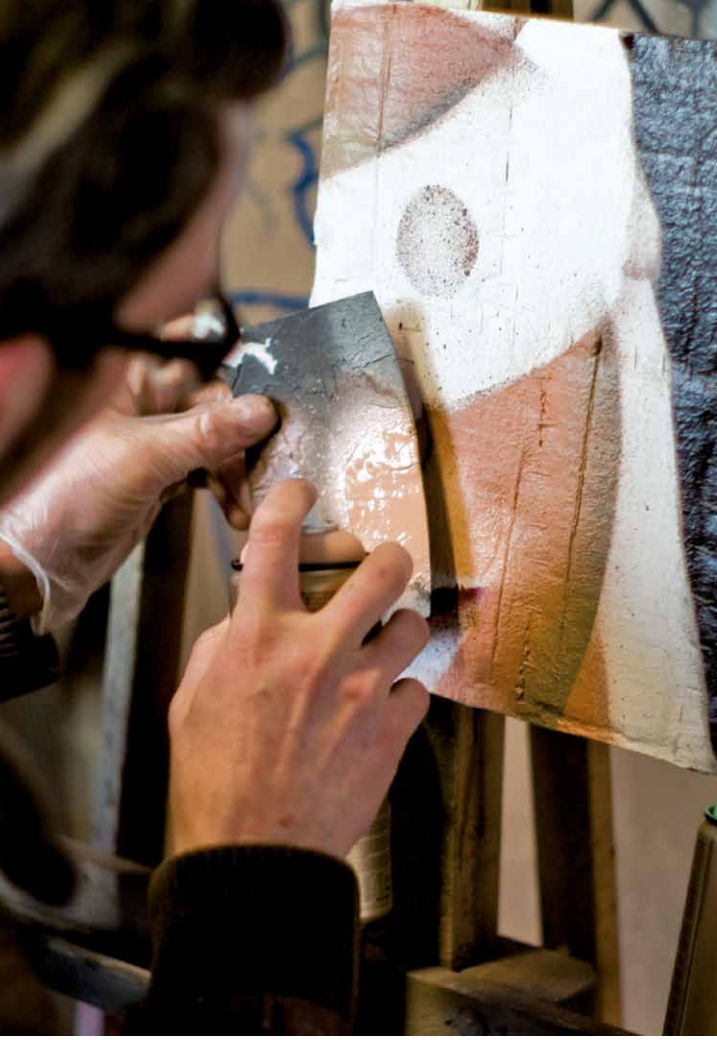
Examples show artwork on canvas and wall (left)/ paper-board (right).

Average spray width will vary depending on the technique of the user. For skinnier lines, spray from a closer distance. For fatter lines, spray from a further distance. The Montana Level Caps were precisely developed for the low pressure system allowing the most even and clean lines with the highest efficiency and accuracy. Spray widths from 0,4cm up to 25cm can be achieved depending on the users skill and experience. For perfect results we recommend the new Level Cap System in combination with Montana GOLD.