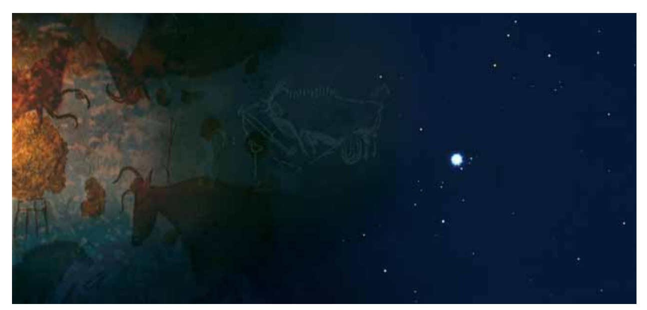
Wall paintings in the Lascaux Cave, Dordogne, France – Sirius belongs to the constellation of stars known as the Great Dog (Canis major). It is the most brilliant star in the night sky as seen from earth.

Mankind experiences oneness with cosmic laws and harmony due to the strength and the magic of colour. They represent wholeness and bestow vitality. They activate personal expressiveness and thus the enjoyment of one's own creativity. The Sirius Primary System connects inner creative power with the cosmic power of the stars.