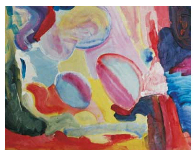
Michi, 8-years. Format 100 x 108 cm

Because the theory of this system is easily understood and readily comprehensible on a practical level, it is exceptionally suitable for colour-training courses, schools and academia. A balanced colour wheel, as well as the entire colour spectrum, has been made accessible in chroma hardly imaginable until now.