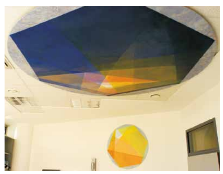
Renate Reifert, Ceiling object and wall motif: in the anaesthetic recovery room of a practice for ambulant operations in Wiesbaden