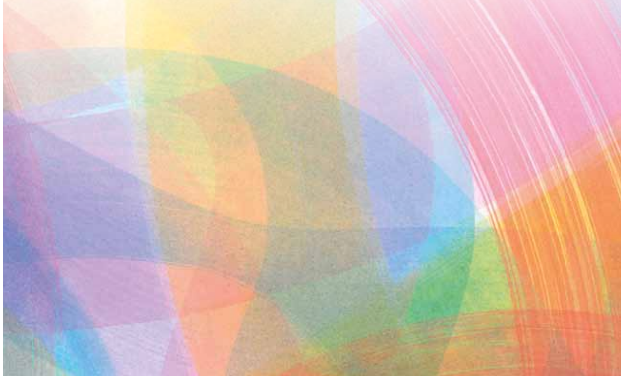
Mixtures of Sirius Primary Watercolours

High quality pigments and binders, along with precise alignment and harmonising of the hues, create the material foundation of this colour system. The Sirius Primary System is based upon 5 primary colours: magenta, red, yellow, cyan and ultramarine. Mixed in equal parts, the 5 primary colours produce a vibrant neutral black. An additional Sirius White rounds off the system.